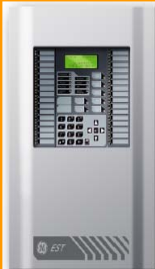
The New GE/EST iO Panel

By doing these few steps, we can be certain that our software is the latest program that is being sent to the field for revision.