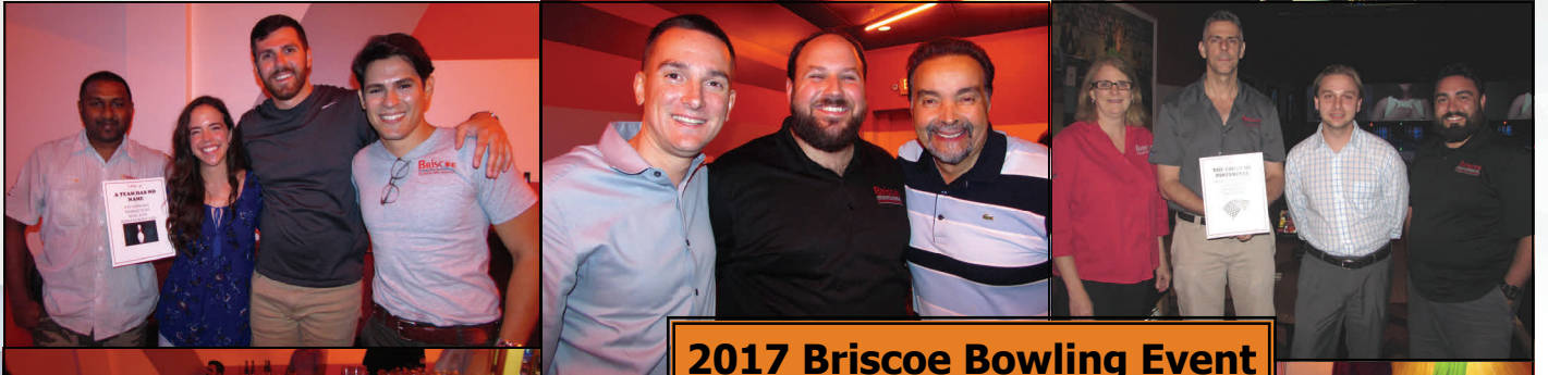
2017 Briscoe Bowling Event