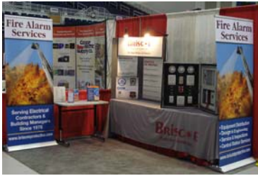
Recent Hofstra trade show

Briscoe Protective has polished their trade show presence with changing the look of their booths for 2009. Smart marketing with bold pull up banners made us stand out from the crowd at the several recent tradeshows recently exhibited at. The branding of images and colors used in our printed materials and website along with the new board of products that JR developed has created a phenomenal professional appearance. In fact quite a few people have voiced a positive response to the new look. As an additional positive note the team working the tradeshow each wear Briscoe Shirts giving reinforcement to the total team theme.