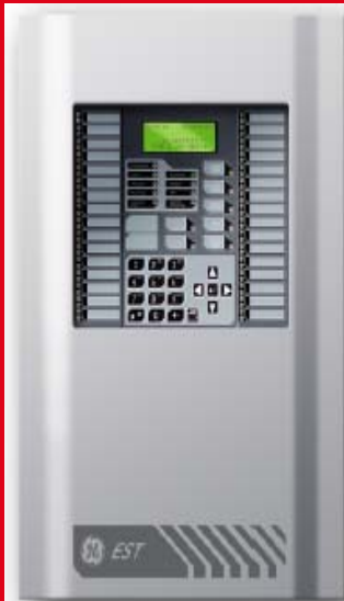
The New GE/EST iO Panel

By doing these few steps, we can be certain that our software is the latest program that is being sent to the field for revision.