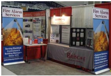
Recent Hofstra trade show

Briscoe Protective has polished their trade show presence with changing the look of their booths for 2009. Smart marketing with bold pull up banners made us stand out from the crowd at the several recent tradeshows recently exhibited at. The branding of images and colors used in our printed materials and website along with the new board of products that JR developed has created a phenomenal professional appearance. In fact quite a few people have voiced a positive response to the new look. As an additional positive note the team working the tradeshow each wear Briscoe Shirts giving reinforcement to the total team theme.