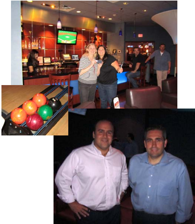
Bowling with BOMA Long Island