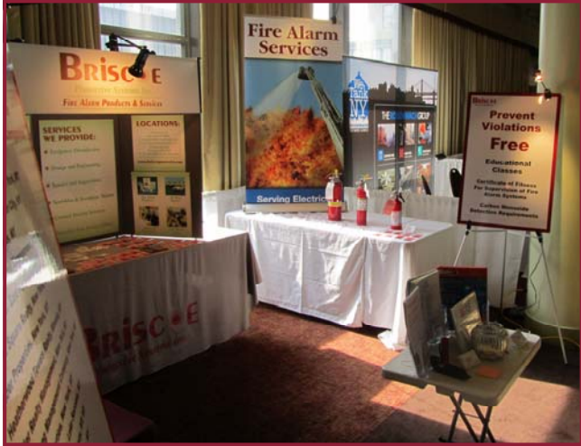
BOMA NY at The Grand Hyatt Hotel