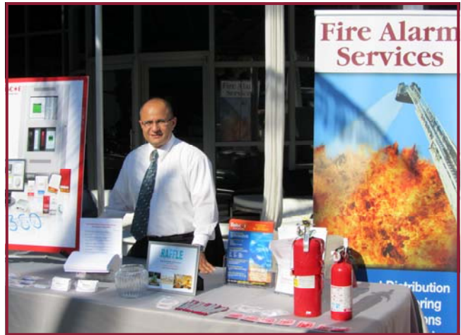
NYARM at The Hotel Pennsylvania