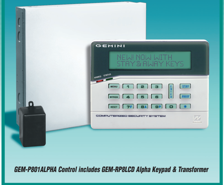
GEM-P801ALPHA Control includes GEM-RP8LCD Alpha Keypad & Transformer