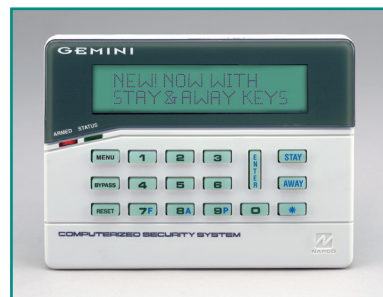
New GEM-RP8LCD Keypad with easy "STAY" & "AWAY" keys.