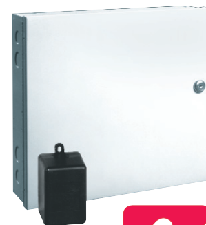
GEM-P801LK, Control Panel less Keypad