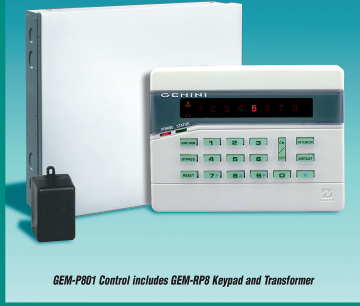
GEM-P801 Control includes GEM-RP8 Keypad and Transformer